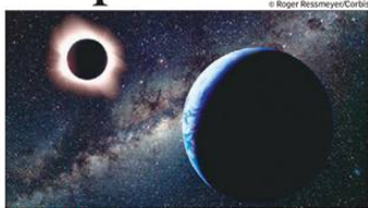
DARKNESS AT SUNRISE: The total solar eclipse, a once-in-2-year occurrence, will be seen as a partial eclipse at sunrise from most places in India. The eclipse should not be viewed with the naked eye as it can cause permanent damage to eyes leading to blindness

New Delhi: A total solar eclipse will occur on March 9 but will be seen as a partial solar eclipse at sunrise from most places in India except from north-west and western parts of the country. Solar eclipse is a phenomenon in which the moon passes precisely between the sun and the earth. It blocks the sun's bright face, revealing the tenuous and comparatively faint solar atmosphere. It happens only about once a year. The total eclipse phase will begin at 6:47 am and it will last till 9:08 am on March 9. The partial phase will, however, end at 10:05 am. In most places of India, the partial phase of the eclipse will begin before sunrise — it means partially eclipsed sunrise will take place on the day. "However, the start of the